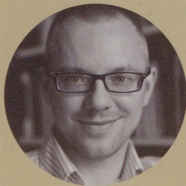
WOJCIECH BOŃKOWSKI Poland's leading wine writer, member of the Conférie