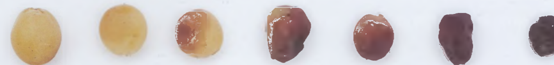
The development of aszú berries

It is also known as Fehér Furmint, Mosler, Moslavac, Posipel, Sipon, Szigeti, Somszóló, Zapfner.