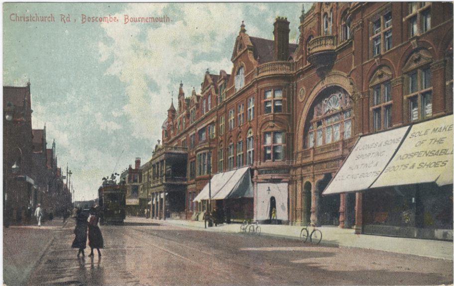
Christchurch Rd , Boscombe, Bournemouth.