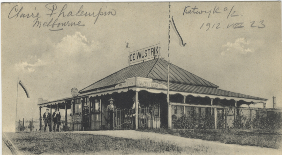
Bierhuis — Speeltuin. Katwijk aan Zee.